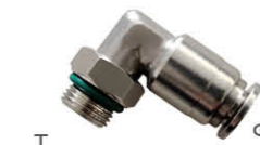
Male Stud Elbow