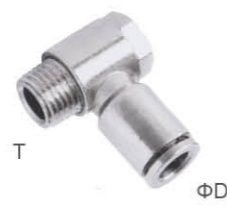
Single Male Banjo