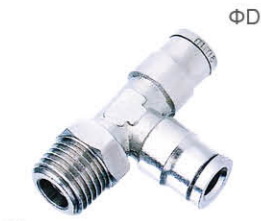
Male Run Tee