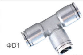
Union Tee Reducer