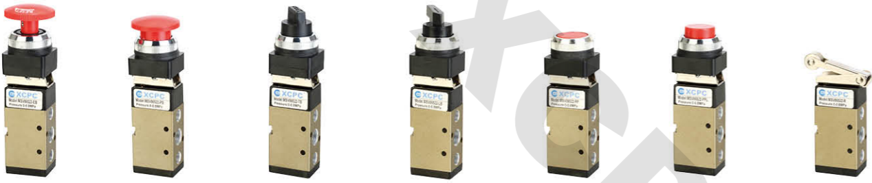
MSV86522-EB MSV86522-PB MSV86522-TB MSV86522-LB MSV86522-PP MSV86522-PPL MSV86522-R