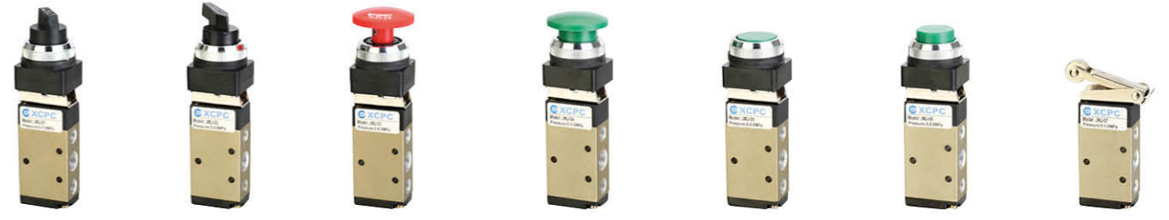
JMJ-01 MJMJ-02 MJMJ-03 MJMJ-04 MJMJ-05 MJMJ-06 MJMJ-07