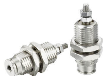
CJPB 10 x 15