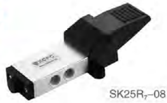
SK25R 7 -08